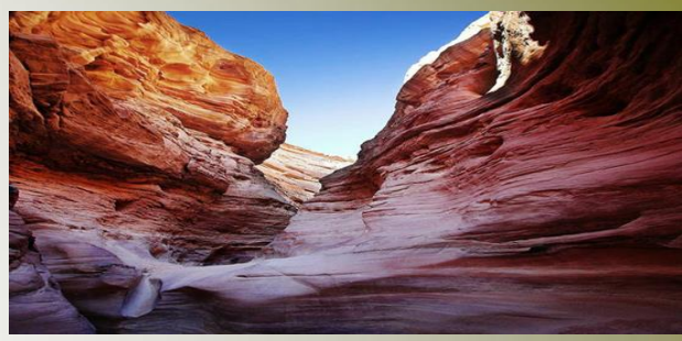
Colored Canyon, Sinai

It is a rock formation on Sinai Peninsula. It is a labyrinth of rocks, some of them have about 40 meters. The canyon is almost 800 meters long. All sorts of creative rock formations can be seen around the Canyon.