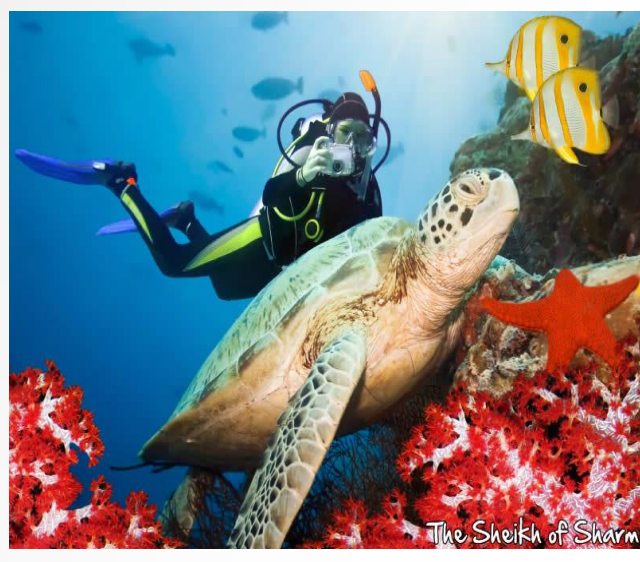
Diving at Sharm El-Sheikh