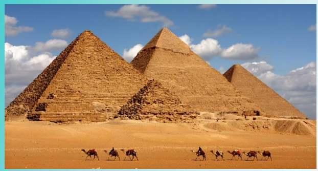
Pyramids (BC), Giza (close to Cairo)

The Great Pyramid of Giza is one of the Seven Wonders of the Ancient World. The base is over 52,600 square meters in area with a stress more than (1100 kPa). It is the oldest green building in the world!