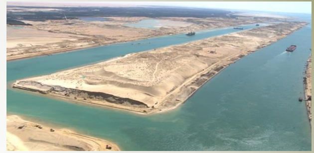
New Suez Canal (Original, 1860), near to Sinai

It is a rock formation on Sinai Peninsula. It is a labyrinth of rocks, some of them have about 40 meters. The canyon is almost 800 meters long. All sorts of creative rock formations can be seen around the Canyon.