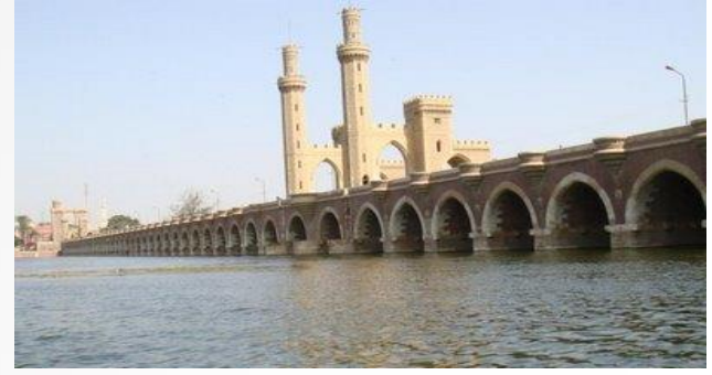
Spans, Egypt (Since 1840)