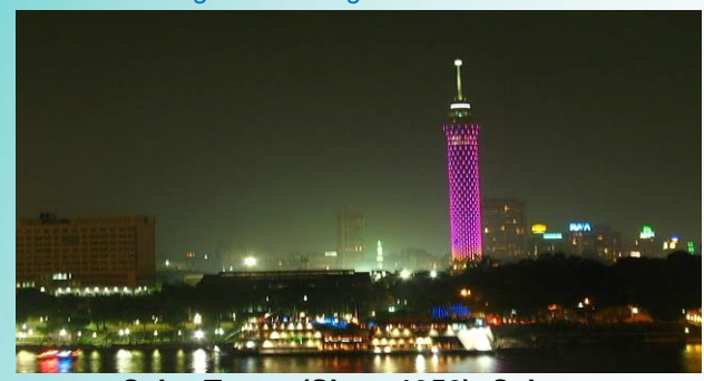
Cairo Tower (Since 1956), Cairo

The Great Pyramid of Giza is one of the Seven Wonders of the Ancient World. The base is over 52,600 square meters in area with a stress more than (1100 kPa). It is the oldest green building in the world!