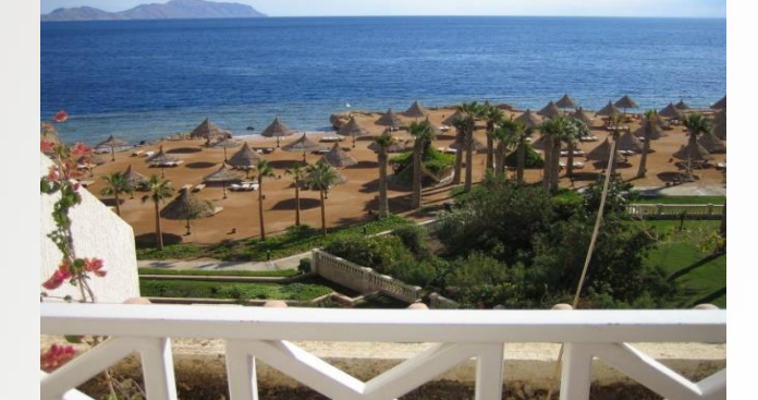
Sharm El-Sheikh "City of Peace"